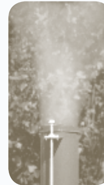
20% Opacity (legal)

Smoke density is referred to as opacity. State law limits the density of chimney smoke to 20% opacity.* 0% opacity means no smoke, 100% opacity is smoke so thick you can't see through it, with 20% opacity, smoke is barely visible.