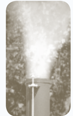
80% Opacity (illegal)

*Smoke density can exceed this limit for 20 minutes every four hours to start a fire and for six minutes once every hour to refuel the fire.